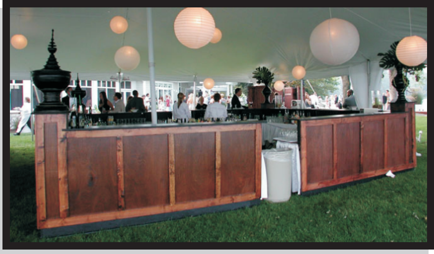
Lighting Shown is by Balloon Effects International